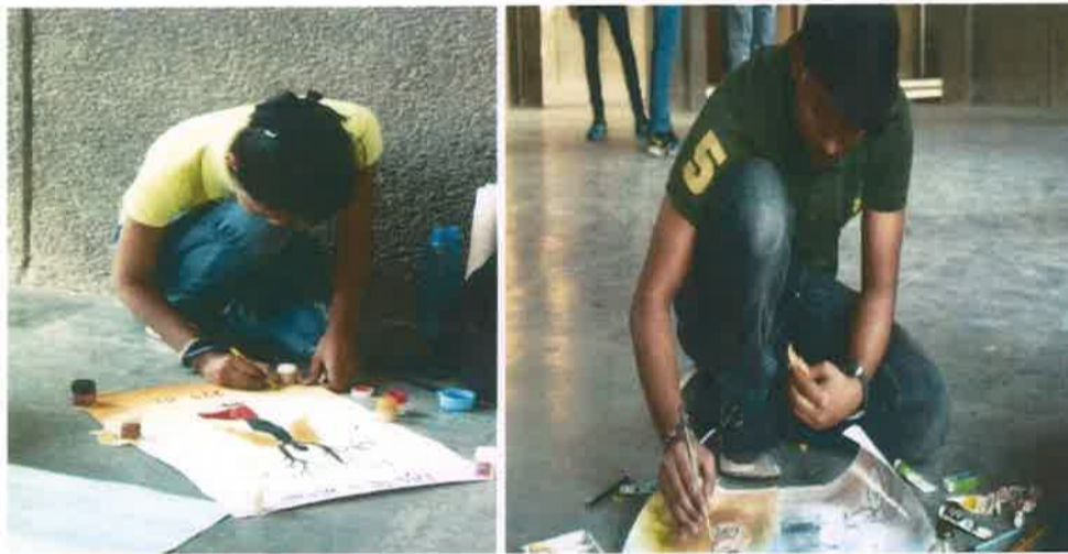
Our students engrossed in putting their ideas on the drawing sheets.